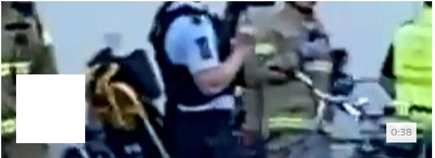
Emergency services outside Copenhagen mall